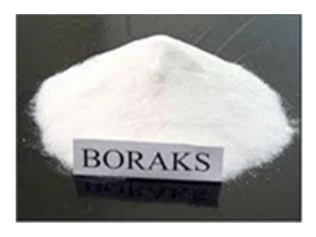
Figure 2. Forms of Borax in the Market.

One of the processed foods that is quite popular with Indonesian people is Meatballs meatballs. are widely consumed because of their practical presentation and are widely available in various places such as traditional markets, supermarkets, and many more, and are sold in types and prices that are affordable for all people, but several publications state that borax is often used as a chewy and savory flavor. In making meatballs. food additives (BTP) or active chemical substances (food additives) are often added. BTP in general are chemicals that have been researched and tested in with existing accordance scientific principles. There are times when just to get a lot of profit or the food that is sold doesn't spoil quickly, the producers add harmful chemicals to the food. Even though these chemicals if added will endanger the health of consumers who consume them [26].