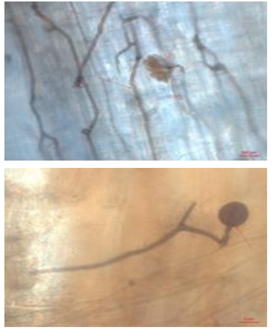
Figture 3. Colonization of Arbuscular Mycorrhizal with mangroves, HI; Internal Hyphae, HE; External Hyphae, V; Vesicles, A; Arbuscular and S; Internal spores.