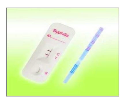
Figure.2 TP Rapid ( Treponema pallidum Rapid ) Primary data source

Tp Rapid may be used in conjunction with Rapid Plasma Reagin as an alternative for the Treponema pallidum Particle Agglunation Assay (TP-PA) (RPR). The TPHA examination is significantly cheaper than the Tp Rapid examination, however the Tp Rapid examination can save time [7].