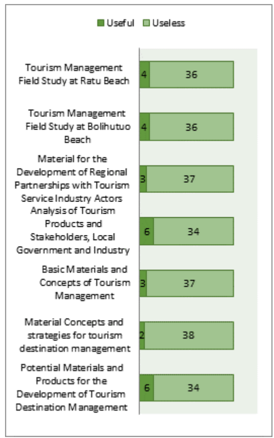
Graph 2. Participants' Assessment of Training Materials

The results of the evaluation show the results as shown in Figure 2 below.